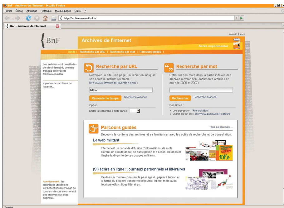
Fig. 2: Home page of the application 'Archives de l'Internet'.

All three tools have been integrated into a single application named after the content: 'Archives de l'Internet' (Figure 2).